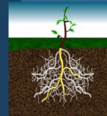
Roots with Mycorrhizae